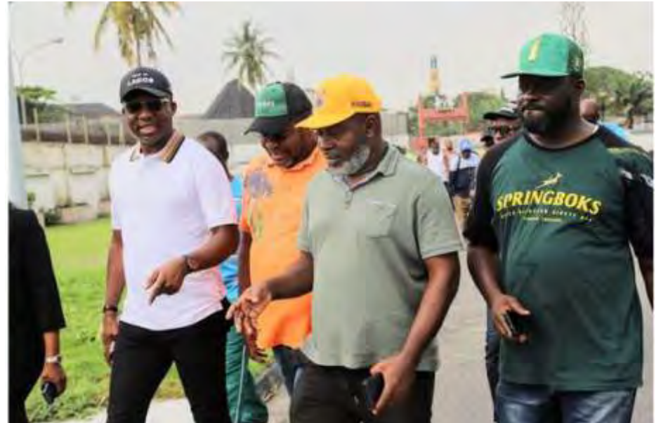
(Lagos State Commissioner for the Environment and Water Resources,

Speaking on what transpired at the Oke Afa/Bucknor location in Oshodi Isolo where several buildings on the drainage setback have been pulled down after delays in enforcing the law, adding that some State to prevent it from The case was, however, struck out, enabling the Ministry to act decisively in the interest of the generality of the people so the contractor that would work on the Ministry are on the secondary collector the site He said it was drainage clearance. the process, they closed He averred that major